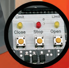
Built-in three push button station