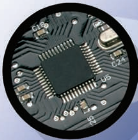
Soft-Stop / Soft-Start with intelligent Obstruction Detection