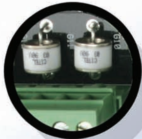
On-board lightning protection

The K-2™ slide gate operator raises the bar in quality for the residential market. This machine operates a highly efficient direct motor drive which allows operation at 100% duty cycle. This assures efficiency and reliability. The fail-safe, fail-secure options of the K-2™ gate operator allows it to handle gates up to 650 lbs. in conformance with UL 325 and UL 991 Type I, III and IV. This operator is UL Listed 18TC UL325 and UL991.