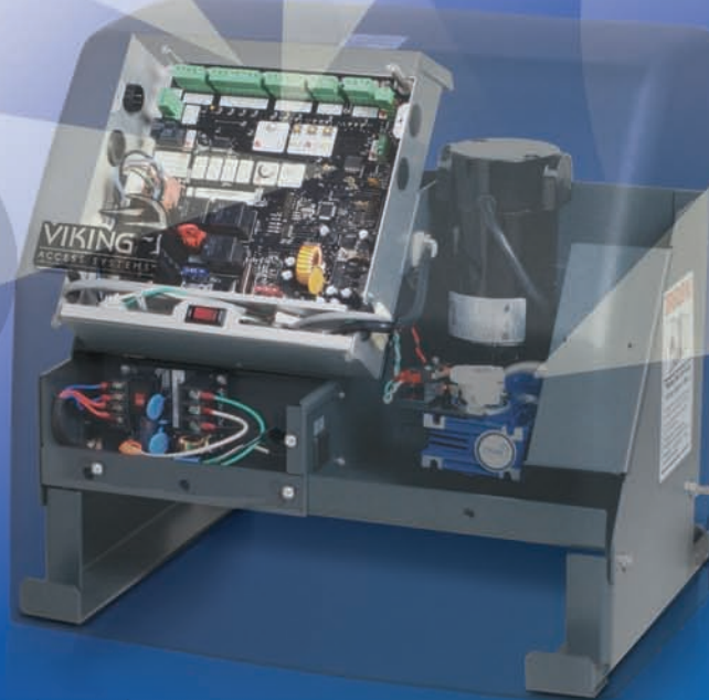
120 / 220 VAC single phase power source