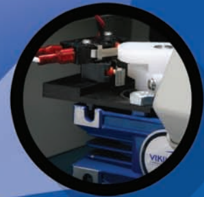
Easy access to limit switch